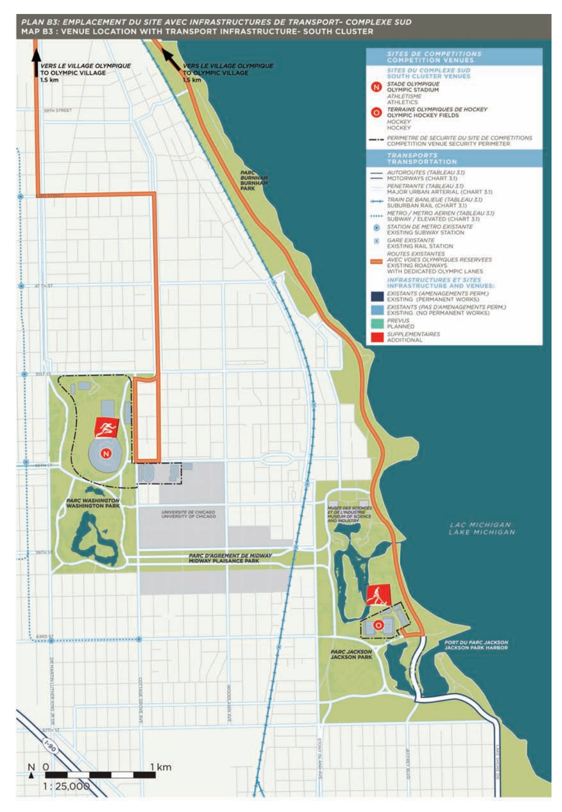
Map 2 CHICAGO 2016 OLYMPICS: SOUTH CLUSTER OF VENUES