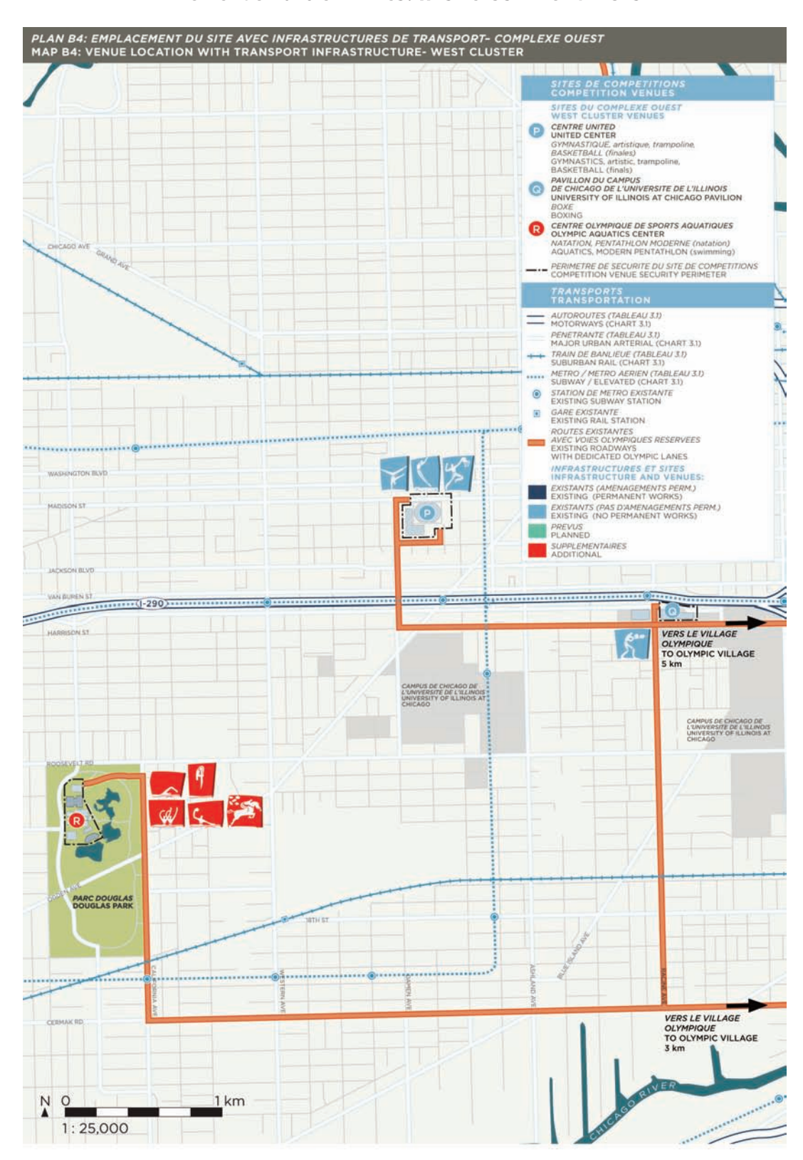
Map 3 CHICAGO 2016 OLYMPICS: WEST CLUSTER OF VENUES